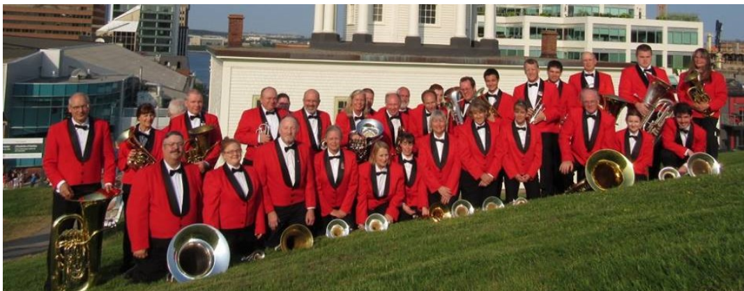
Lower Brass of the NABBSS