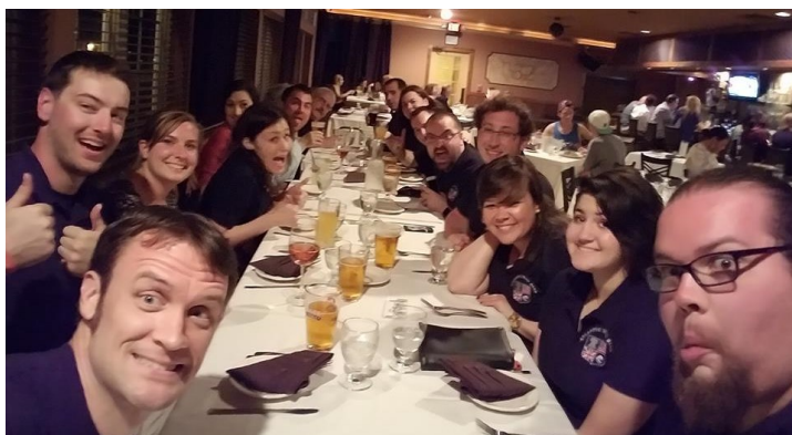
The Band hanging out together after the show