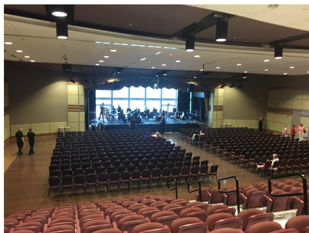
Setting up in Convention Hall