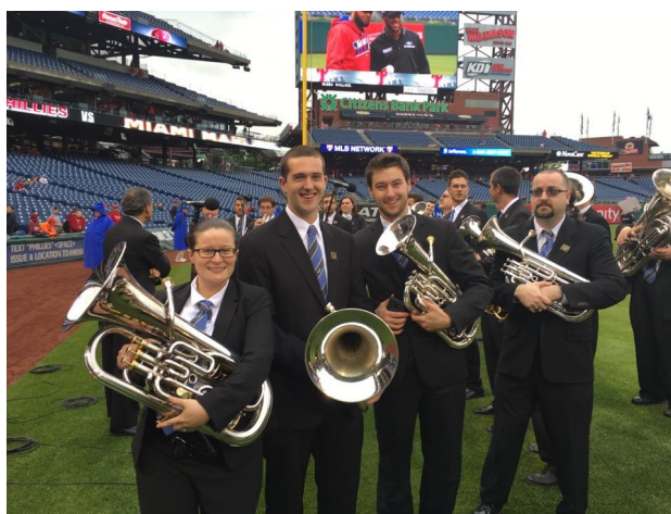
Our euphonium & baritone row always ready to pose for a picture.