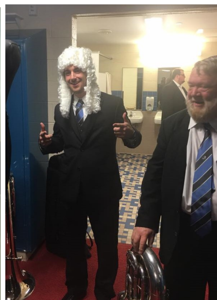
This we're not really sure about!