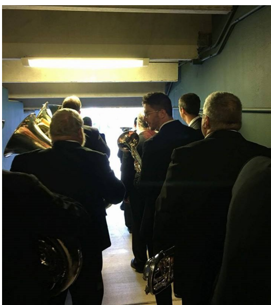
Waiting in the tunnel to go on.