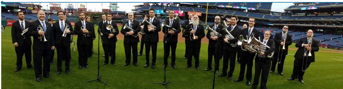
The Band posing for a pre-performance picture once Sal figured out the panorama setting.