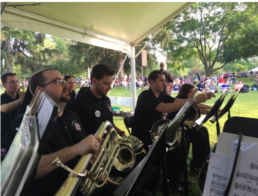
Getting up the next piece

June 11th was an absolutely beautiful day despite the possibility of thundershowers. ABB returned for their third year at the Festival and were very well received as usual. Other bands in the Festival included Rockville Brass Band, Spires Brass Band, Penn View Brass Band, Benfield Brass Band, and the Chesapeake Silver Cornet Band