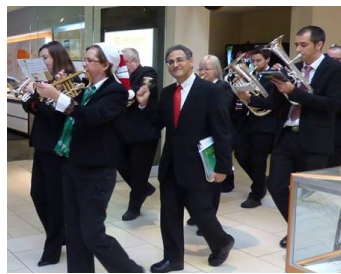
Sal's famous "Jingle Baton"