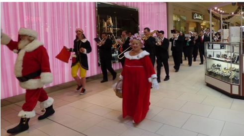
Santa, Mrs. Claus, Hyper-Elf & ABB