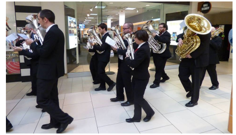
Whit Friday, here we come!