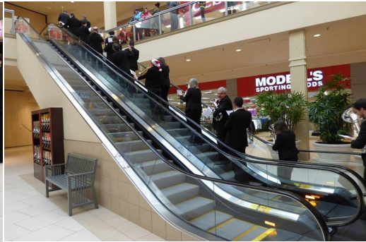
An ABB first: playing on an escalator!