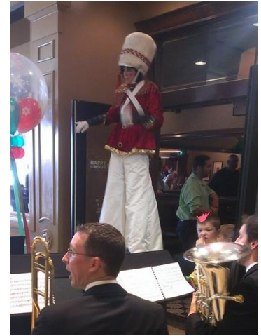
The world's tallest conductor!